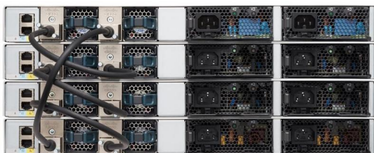
Figure 4. Cisco Catalyst 9200 Series Switch stacked units