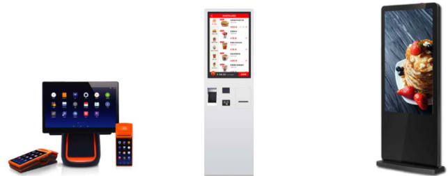
Point of Sale

IT admins can track device location in real-time and create geofences and get notified every time a device moves in or out of a geofence.