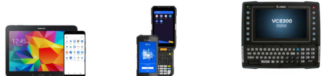
Phone & Tablet